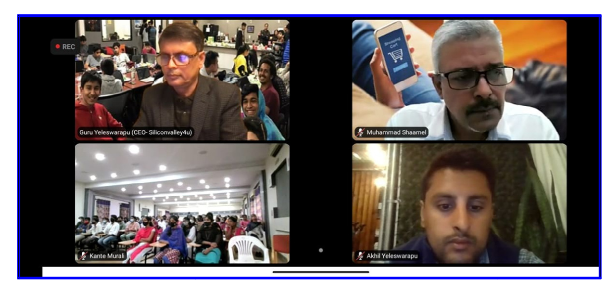
Resource Persons interaction with students