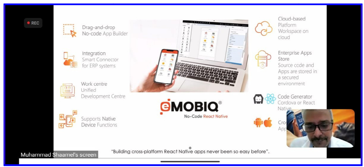
Display of the PPT