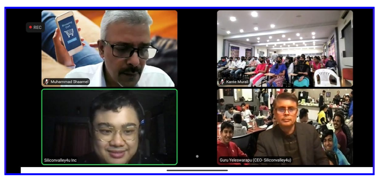
Resource Persons interaction with students